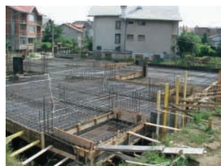
Build Stage June 2006